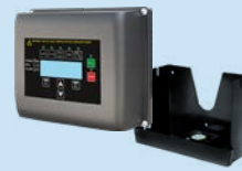
Self vented wall support

POOL4-I is the new generation of Commercial pool pumps integrating a new frequency inverter to get a great comfort and minimize the energy costs. The system allows the programming of several daily filtration cycles with different operating speed for each cycle. In installations with several POOL4-I the pumps automatically communicate and alternate to work the same amount of hours. Capable to work more than one pump at the same time.