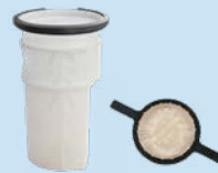
Pre-filter sieve and opening key

Self-priming pump for pools with a large built-in pre-filter, which, together with the excellent hydraulic performance of the pump, generates a very high filtration capacity. Includes a transparent polycarbonate pre-filter lid with opening key for effortless opening and easy inspection of the sieve. Pump body, seal housing and diffuser reinforced with glass fibre polypropylene are resistant to chemical products used for pools and guarantee excellent duration.