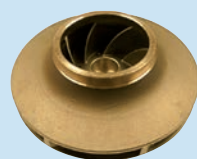
Bronze impeller (on request)

High-flow self-priming vertical pool pump available at 4 poles up to 10 HP ideal for quiet operation and larger filtration. Cataphoresis painting, pre-filter in AISI316 and pump body in polypropylene with glass fiber give a remarkable resistance to corrosion. In addition, a large support base make the whole system particularly robust.